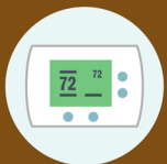
Central Air Conditioners

Basement items are covered under Building Coverage if they are connected to power and installed. Examples include: