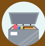
Freezers and Contents