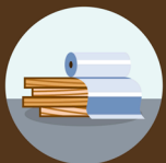
Finished Basement Home Improvements

Items not specifically listed in the policy are not covered in a basement. Examples include: