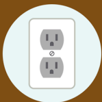
Electrical Outlets and Light Switches