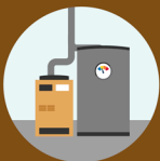
Furnaces and Hot Water Heaters