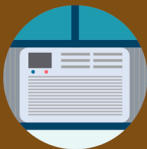
Window Air Conditioners