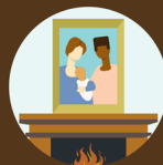
Family Photographs or Keepsakes