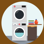
Clothing Washers and Dryers

Basement items are covered under Contents Coverage if they are connected to a power source. Examples include: